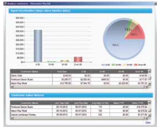
Quickly view your financial position