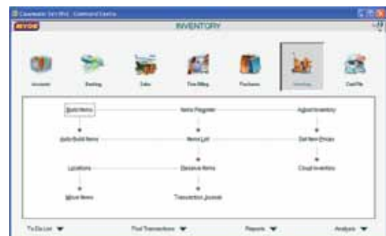
Easily manage your inventory