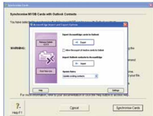
Effectively manage your customers