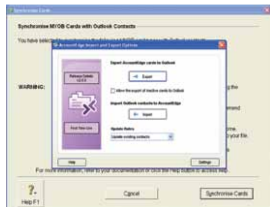
Effectively manage your customers